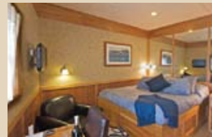
Captain Stateroom B2

Feature king or twin beds, a windowed door or view windows, and private bath with Jacuzzi tub and shower.