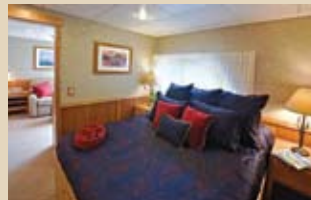
Commodore Suites A1 and A2

Please note: Commodore Suites and Admiral Staterooms: A1, A2, C1 & C2 offer triple accommodations. Master Staterooms: B3, B8, B10, B12 & B14 are fixed queen size beds - B7, B9, B11 & B13 are twin size beds that can be configured to a queen size bed.