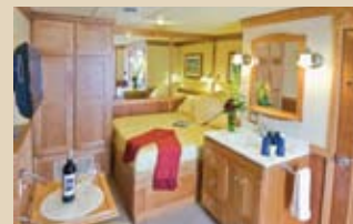
Master Staterooms B3, B7, B8, B9, B10, B11, B12, B13 and B14

Feature king or twin beds, view window, windowed door and private bath with shower.