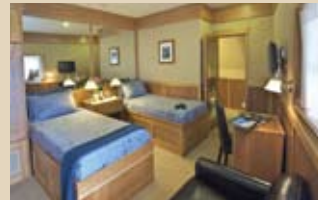
Admiral Staterooms B1, C1 and C2

Feature a separate sitting area, king or twin beds, private bath with Jacuzzi tub and shower, view window and a sliding glass door opening to a small balcony.