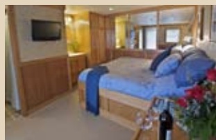
Commander Staterooms B15 and B16

Features king or twin beds, view window, windowed door and private bath with Jacuzzi tub and shower.