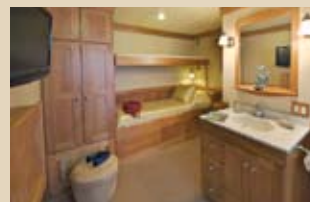
Single Stateroom B6

Feature queen or twin beds, view window, windowed door and private bath with shower.